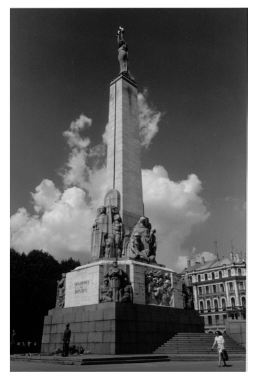
Figure 1. Freedom Monument.