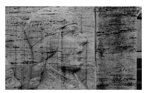
Figure 3. Fragment of the travertine relief of Freedom Monument 2 years after restoration and hydrophobic treatment without any maintenance. Left side of the figure shows the hydrophobic surface, the right side - untreated surface. The untreated surface shows uniform soiling while treated surface has heterogeneous dislocation of soiling in the form of vertical run-off lines.

In the frame of 2 years the protective treatment had not shown inhibition effect on biological growth and the intensity of development in comparison to the untreated stone. The protective treatment did not increase the bio-contamination of the travertine, although the microbial contamination could act as a preliminary precursor for the development of crusts [6]: increases adsorption of airborne particles on the stone surface; enforcing alterations in the capillary water uptake and water vapour diffusion in the rock material. For the treated surfaces the occurrence of biofilms has to be seriously considered due to organo-chemical,